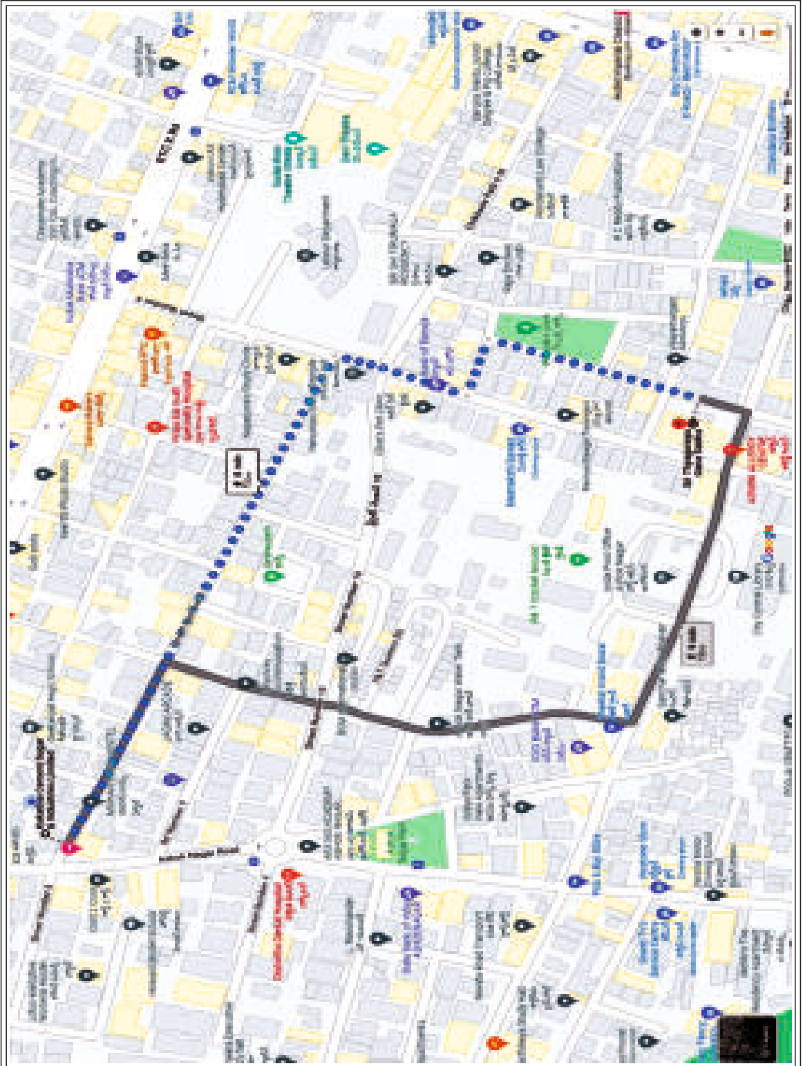
Route Map to AGM Venue